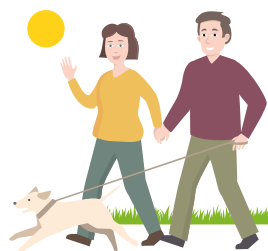
physical exercise limit sedentary behaviour

A healthy lifestyle helps prevent type 2 diabetes FOR MORE THAN HALF OF ALL PEOPLE.